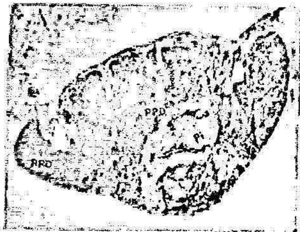
FIG. 1. Pituitary of Colisa fasciata . Bouin's fluid, CAHP, \times 60 . N = neurohypophysis, Pi = pars intermedia, PPD = proximal pars distalis, RPD = rostral pars distalis. Arrows show the position of cyanophils.

a few chromophobes. The pars intermedia is comprised of predominantly acidophils having large nuclei and finely granulated cytoplasm, few cyanophil and chromophobe cells.